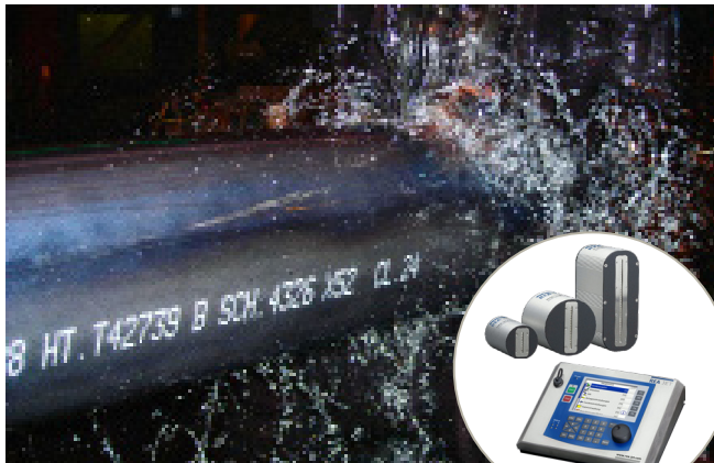
REA JET DOD 2.0 - pipe marking