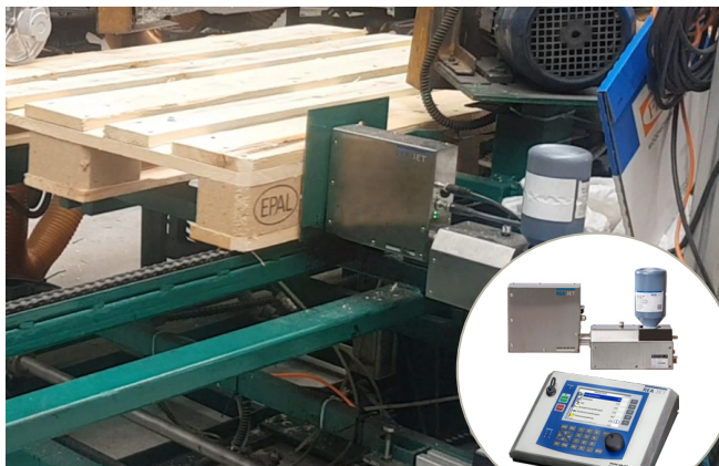
REA JET GK 2.0 - pallet marking