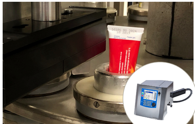
REA JET SC 2.0 - plastic tube marking