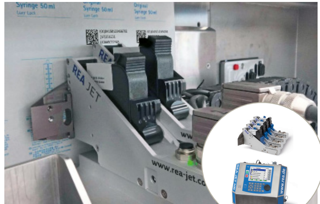
REA JET HR - packaging marking