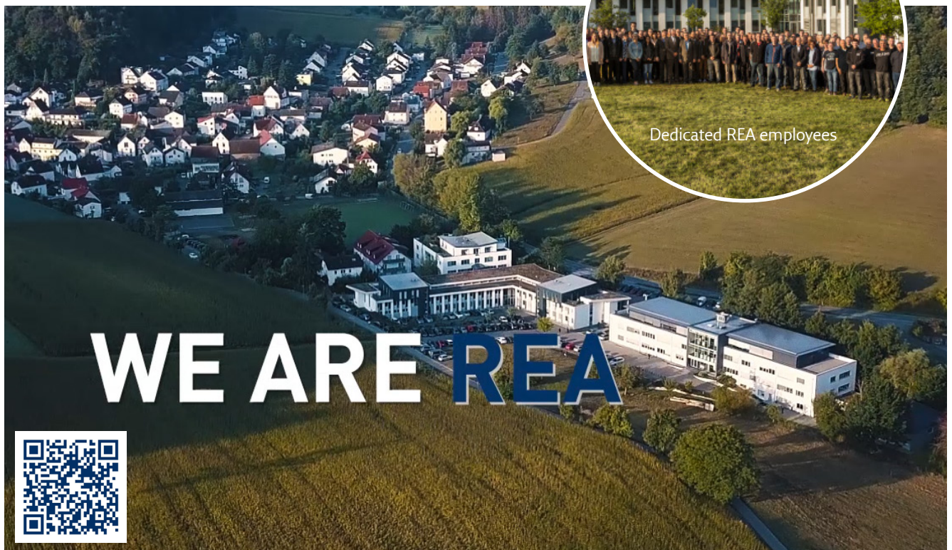
REA Headquarters, near Frankfurt am Main/Germany