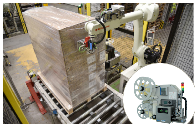
REA LABEL - robot labeling system