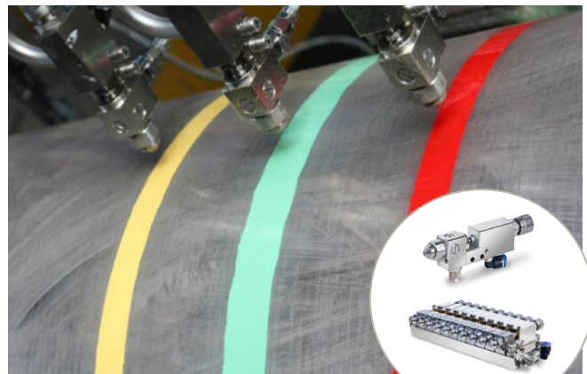
REA JET ST - colored quality marks