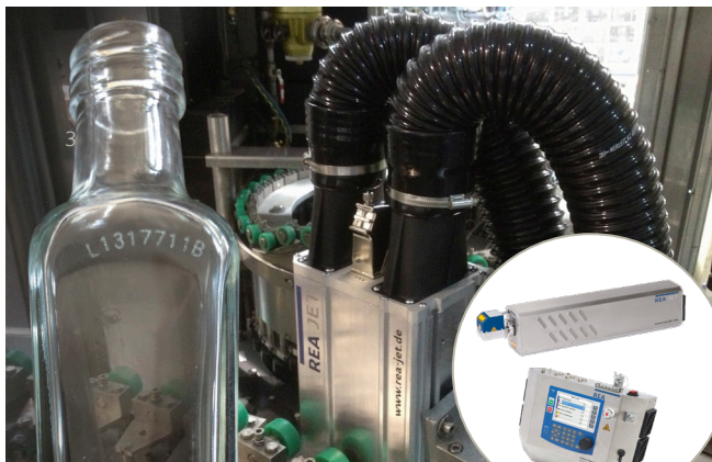
REA JET CO 2 Laser - glass marking