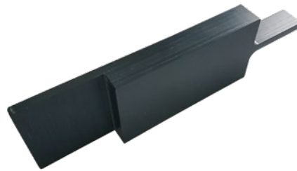
REA VeriCube parallel underlay as distance gauge

REA VeriCube with diffuser. The distance adapter is required for adjustment and calibration. It can also be used for measuring folding boxes or labels