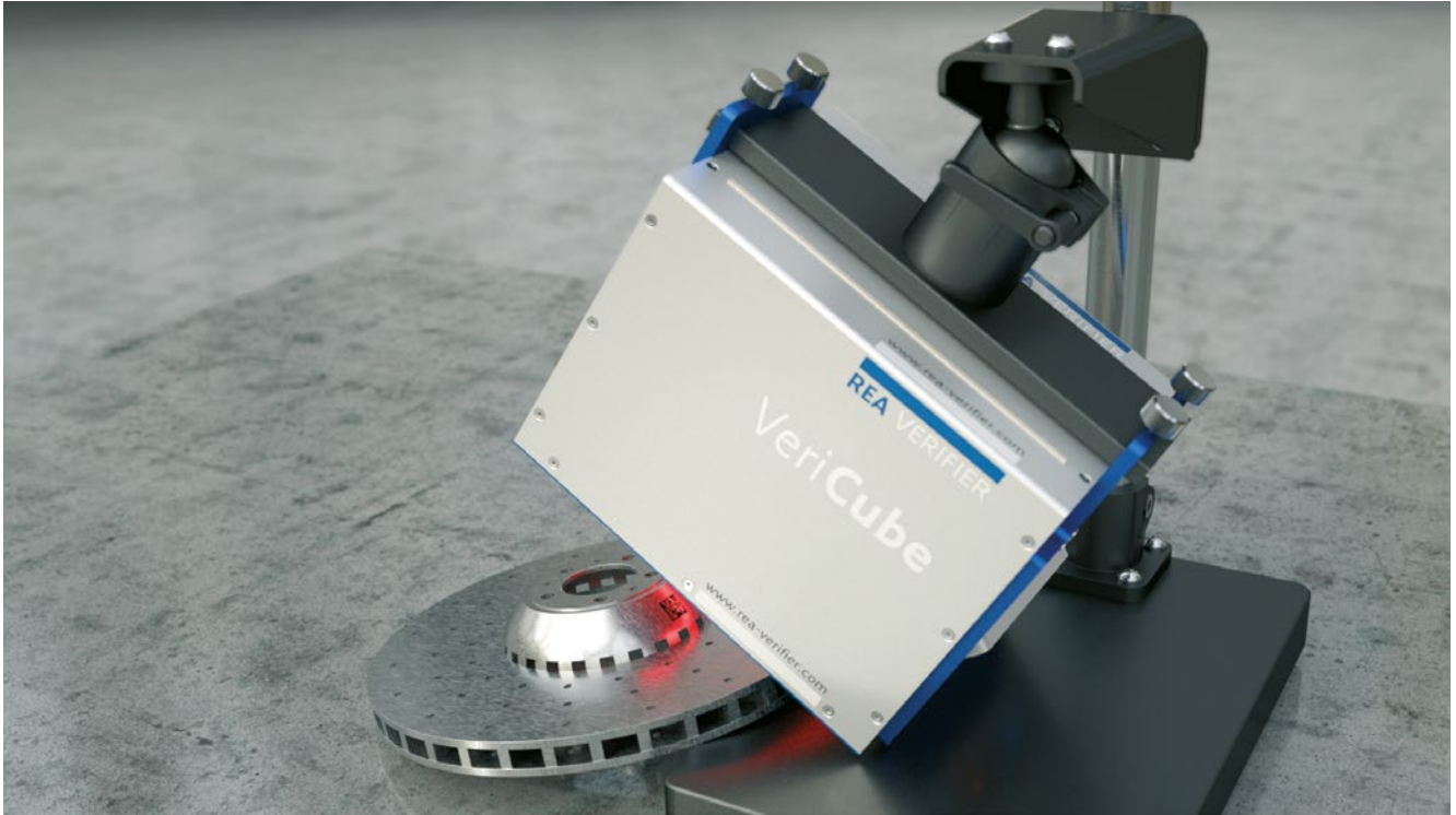
Stand solution for code verification on 3D objects