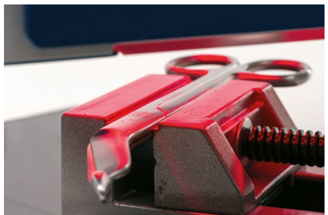
Verification of surgical instruments