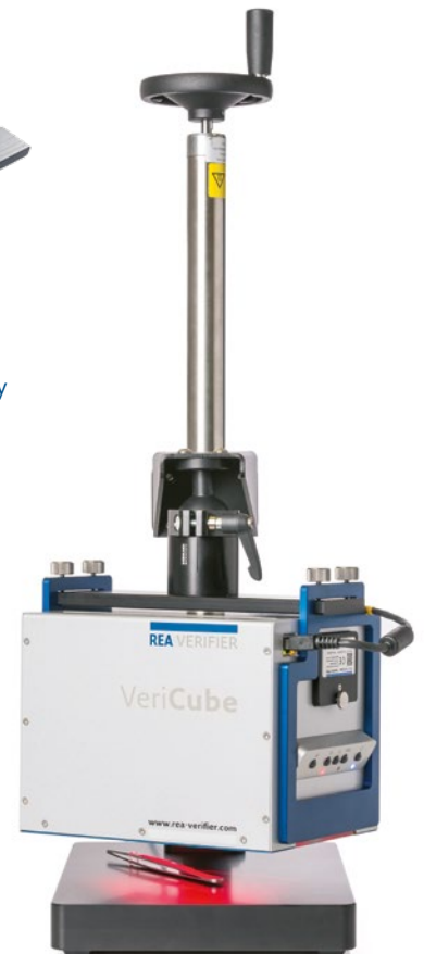
Verification of tweezers

REA VeriCube with diffuser. The distance adapter is required for adjustment and calibration. It can also be used for measuring folding boxes or labels