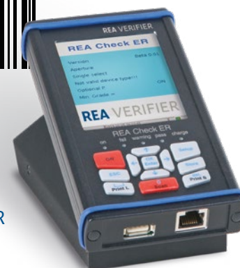
REA Check ER