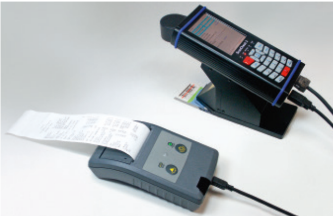
Creation of test protocols