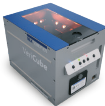
REA VeriCube (for 2D codes and barcodes, ready for 21 CFR Part 11)