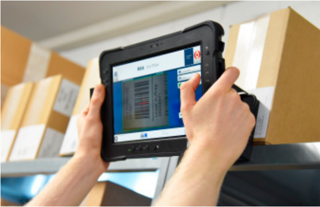
Mobile verification of barcodes on labels