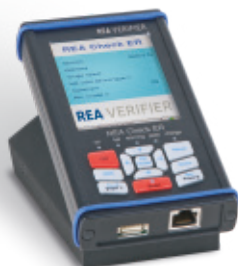
REA Check ER (compact, for barcodes, mobile)