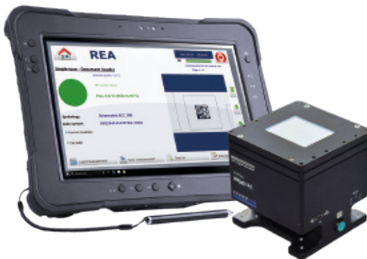
REA VeriMax Mobile (mobile device verification of 1D and 2D codes)