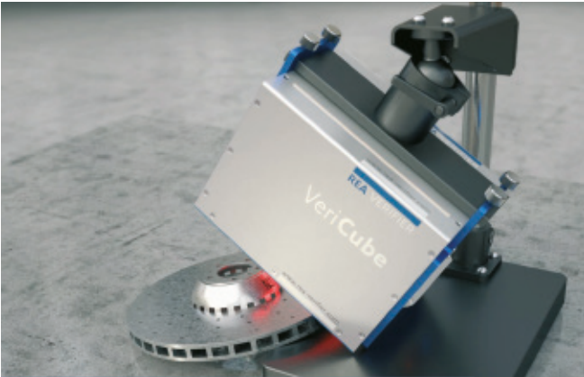
Stand solution for code verification on 3D objects