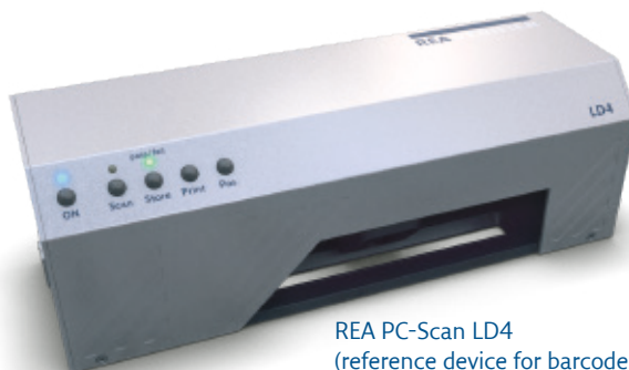
REA PC-Scan LD4 (reference device for barcodes)