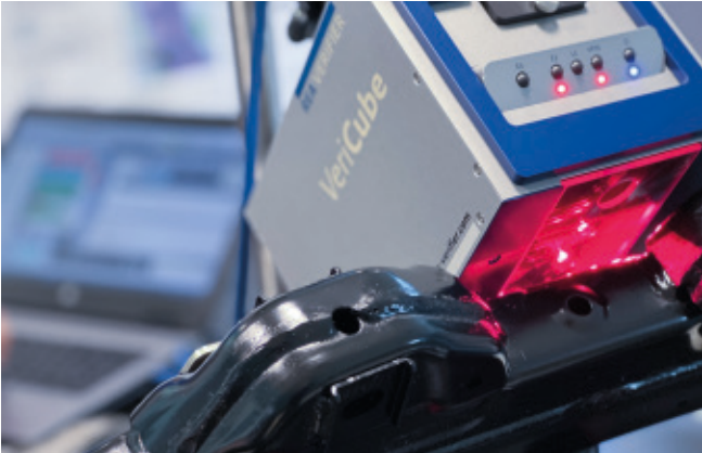
Verification of barcodes on metal