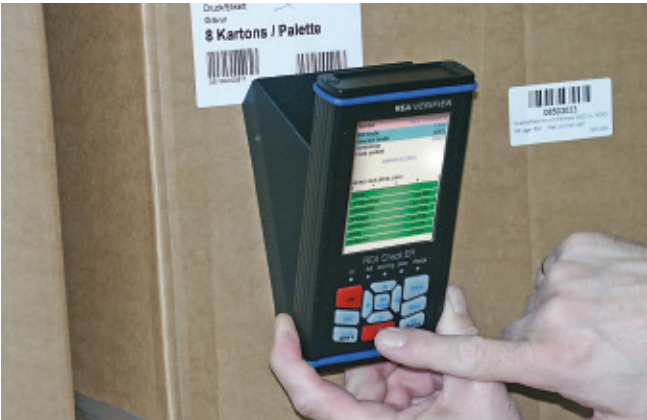
Flexible verification of barcodes on site