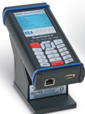
REA Check 3 (universal, for barcodes, mobile)