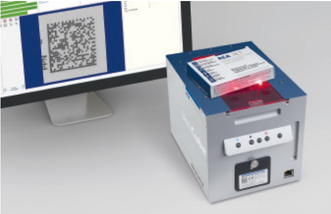
Verification of Data Matrix codes on product packaging