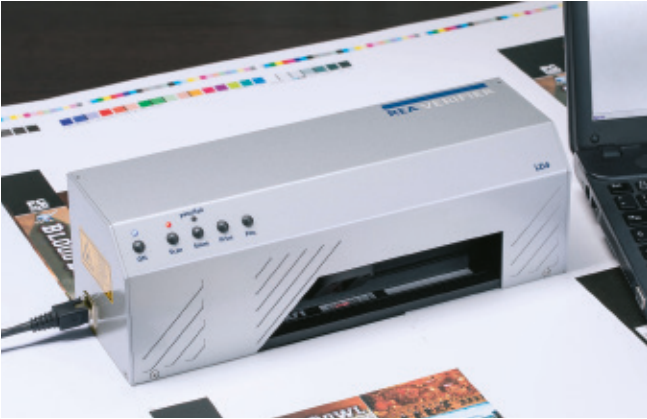
Measuring of barcodes on print sample sheets