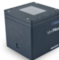
REA VeriMax (for 2D codes and barcodes, for mounting in production lines)