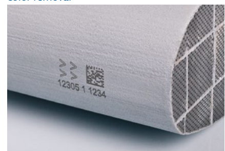
2D Code marking of soot particle filters