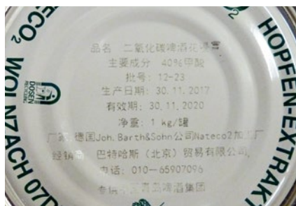
Marking of cans