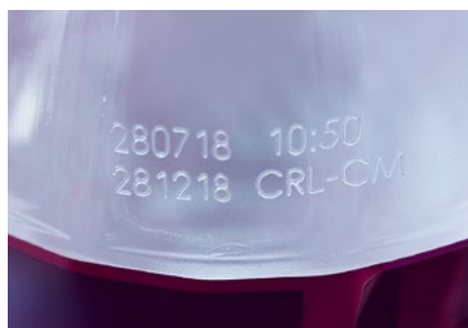
Marking of PET bottles