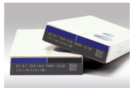
Coding and marking of packaging through color removal