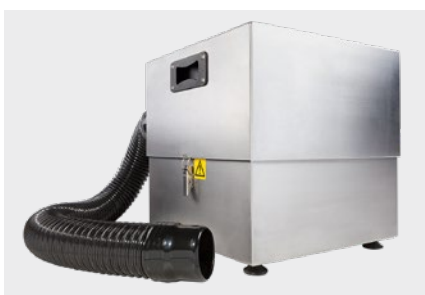
Accessories: Cooling Unit