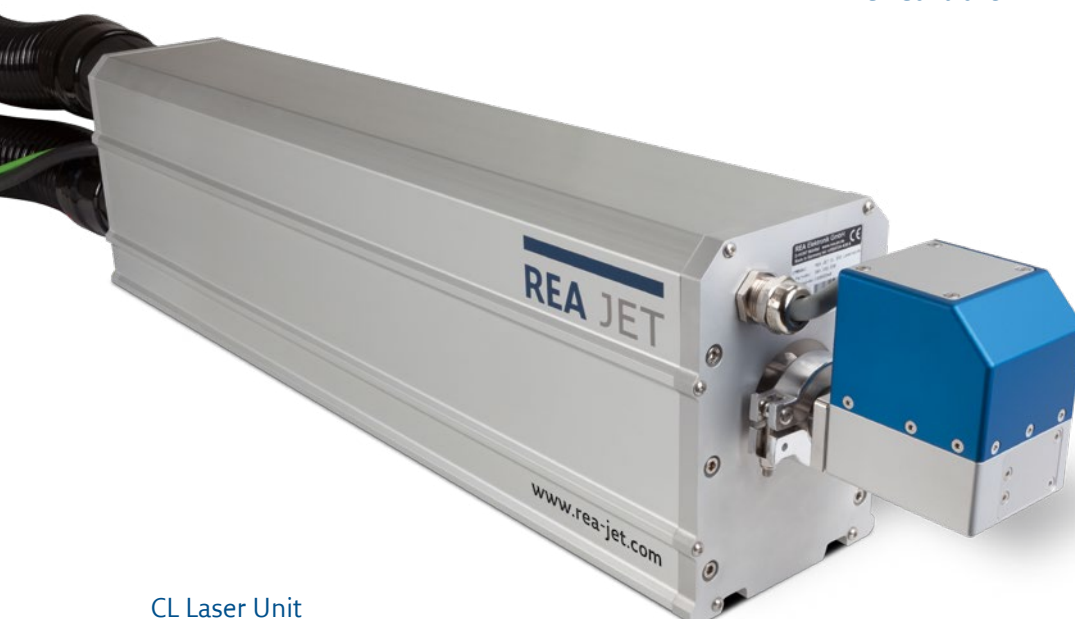
CL Laser Unit protection class IP65