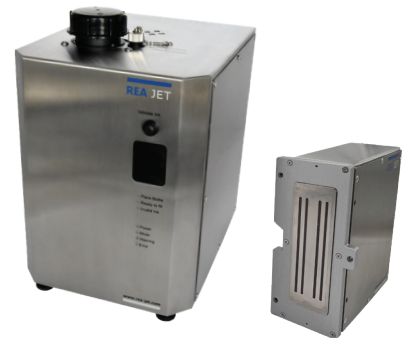
Ink supply unit With print head