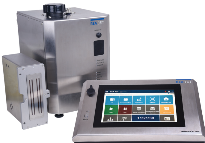
REA JET UP with Touch Controller and ink supply unit

The rugged and at the same time compact device design allows for easy integration into any product line. It also makes it suitable for Industry 4.0, which is a matter of course for REA JET.