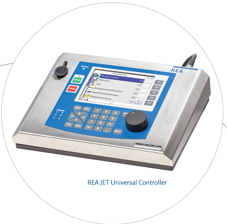
REA JET Universal Controller