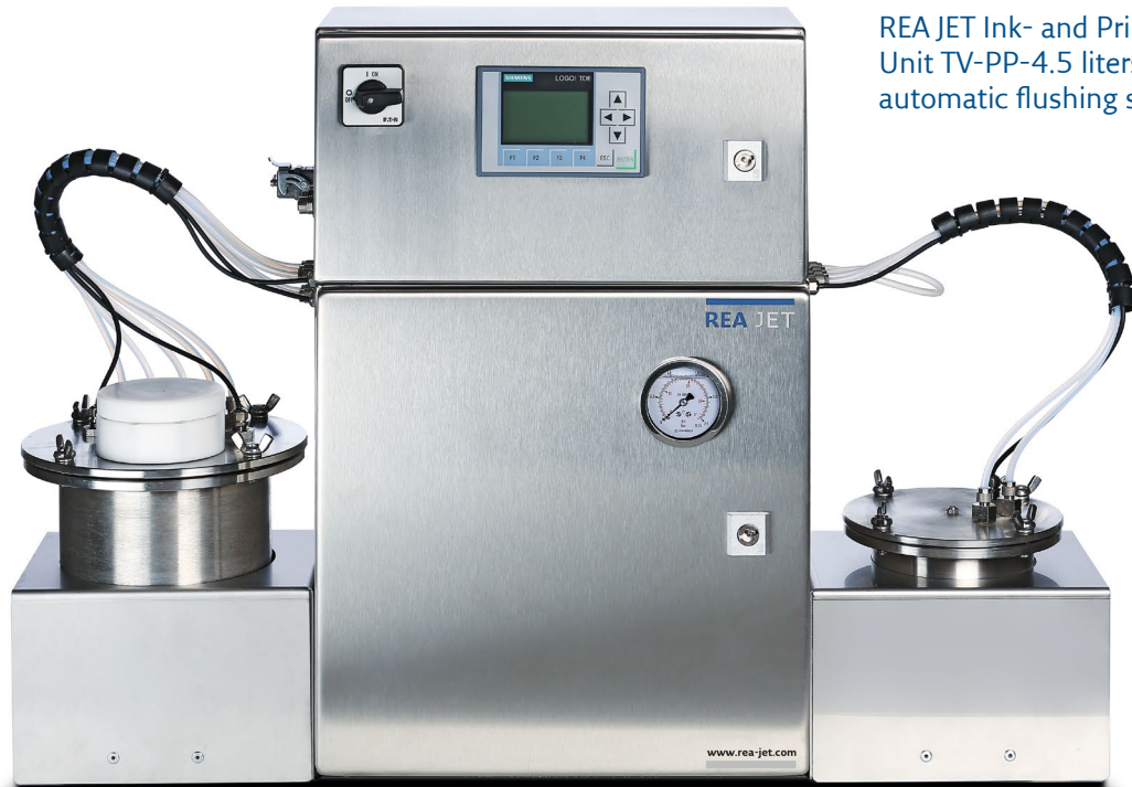
REA JET Ink- and Primer Supply Unit TV-PP-4.5 liters (AFS) with automatic flushing system

REA JET offers various ink and primer supplies - the right solution for every customer requirement.