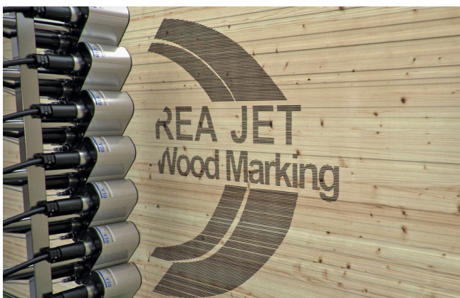
Large marking of logos on stacked boards