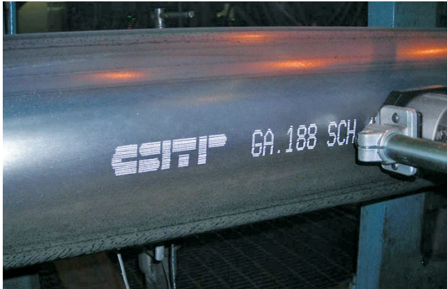
Coding and marking of pipes (steel, plastic etc.)