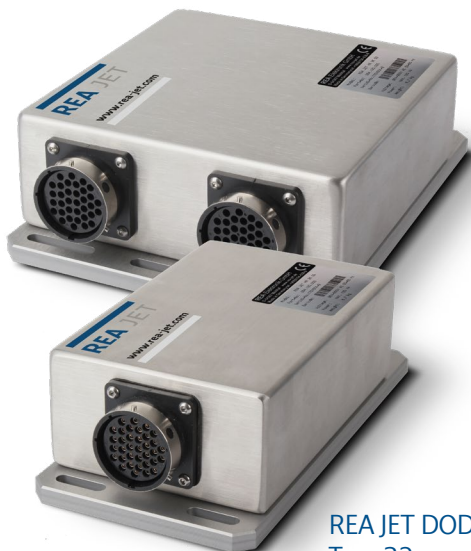
REA JET DOD 2.0 - Print Head Controller Units Top: 32 nozzles, bottom: 7/16 nozzles