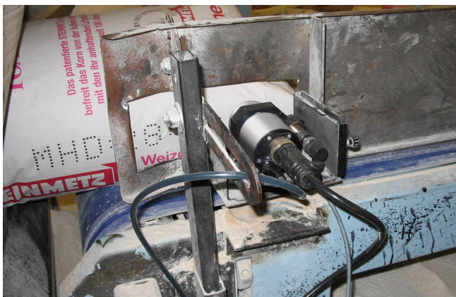
Marking of paper bags