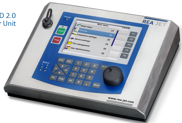
REA JET DOD 2.0 Controller Unit