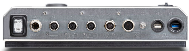
Rear view REA JET DOD 2.0 Control Terminal - port panel