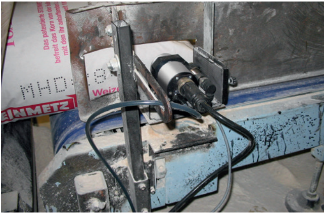
Sidewise best-before-date marking with DOD