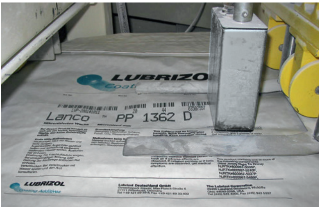
Marking paper bags with GK 2.0