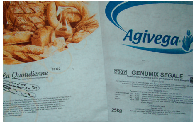
GK 2.0 - Detailed description on paper bags