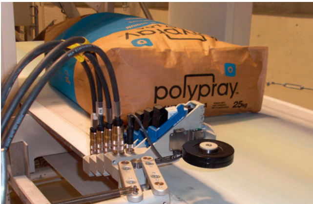
Bag marking with 4 cascaded HR print heads