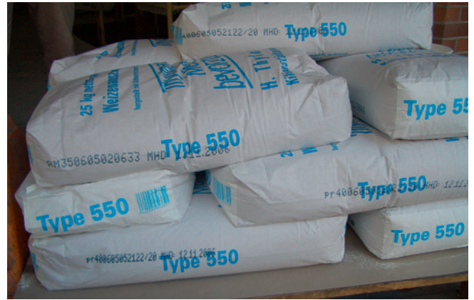
DOD marking of filled flour bags